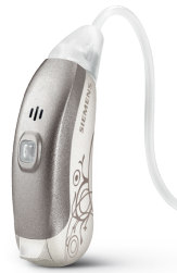
Siemens Life™ ●●●○