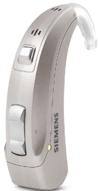
Motion® PX ●●●○