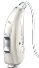
Motion® SX/SA ●●●○