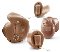
Insignia™ Customs ●●●○