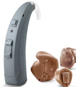
Nitro® / Nitro Customs ●●●○