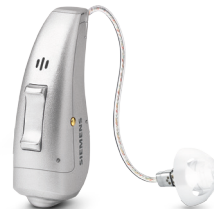
Carat™ / Carat A ●●●○